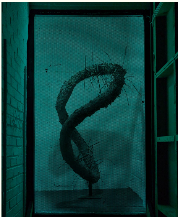
Field of Difference, Gusty Ferro