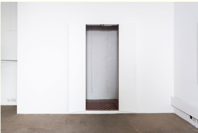
The Door entrance, Palmer Gallery

Each presentation will showcase artists whose practices emphasize multi-sensory installations, site-specific work, and the transformation of space into immersive and thought-provoking environments. The name The Door is drawn from a poem by the Czech modernist Miroslav Holub (see above). The poem is about stimulating intellectual curiosity through endeavour, while feeling and responding to reality through an appreciation of the present. It encourages readers to embrace change and uncertainty by stepping into the unknown, suggesting that even the act of opening a door can lead to discovery, renewal, and possibility. The name also highlights the physical partition between the main gallery and The Door space, serving as a gateway into the artist's world - a portal that can be shaped and reimagined with each new presentation.