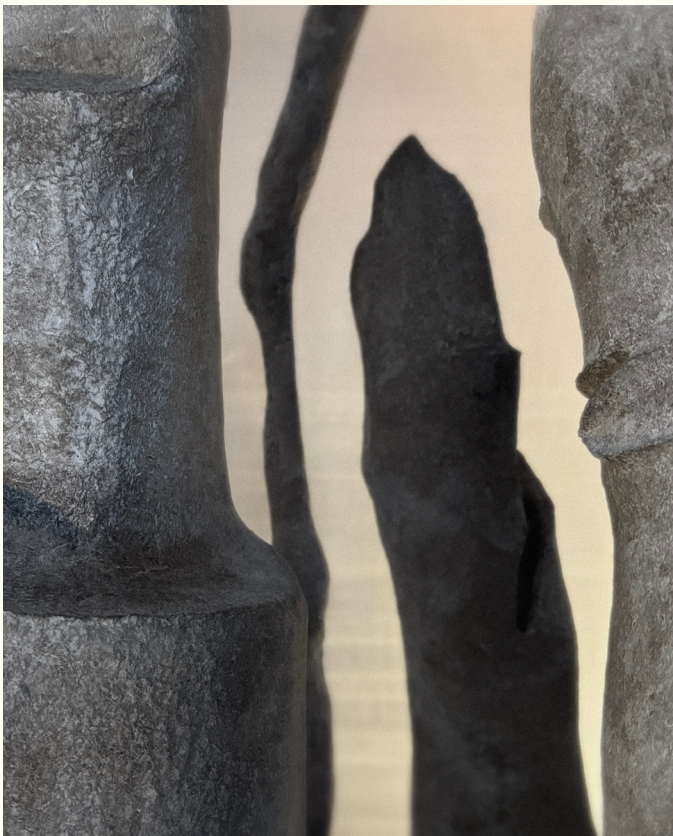
It murmurs , Carolina Aguirre, 2026, Multimedia installation, Dimensions variable

Painted surfaces carry echoes of silt and smoke. Softly emerging and dissolving into these planes are traces of bodies and code. Marked through instinctive, performative gestures, these imprints are porous, fleeting, and expansive, morphing over time. The works have a visceral, hazy quality, evoking deep time, transformation and a return to nature.